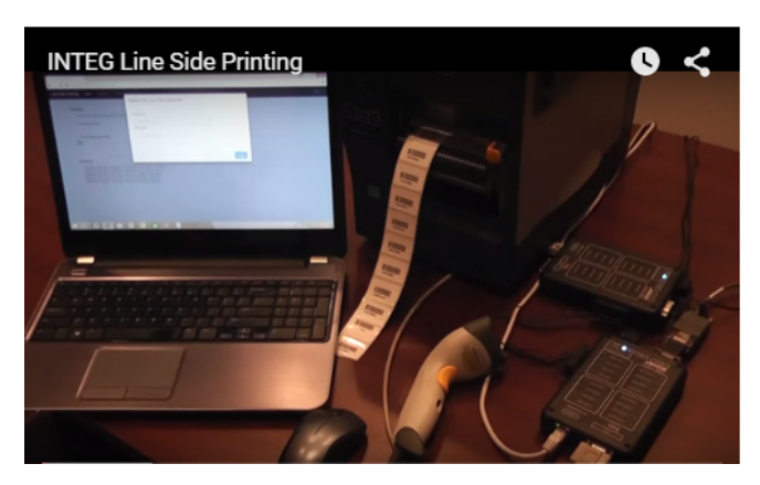
JNIOR 410 with Zebra Printer and Bar Code Scanner